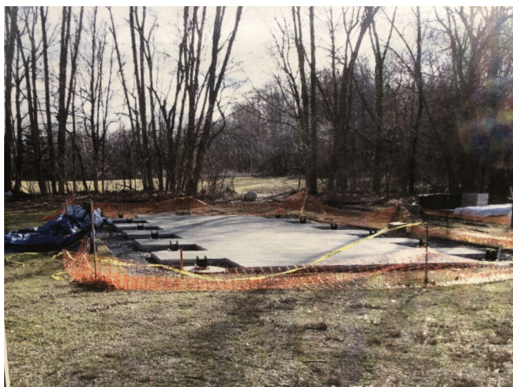
Foundation at Endicott Park Rotary Pavillion

Announcements: Danvers YMCA is having its BIG Fundraiser on Feb 1st at the Danvers Y. For more info www.DanversYMCA.org