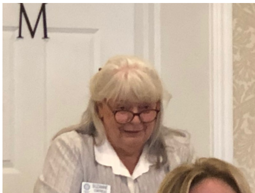
Vice President Suzanne Contreas

Lunch: coffee, iced water, mixed salad, roasted potatoes, roasted vegetables, cranberry sauce and cheesecake for desert.