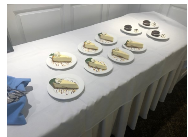
Cheesecake for desert